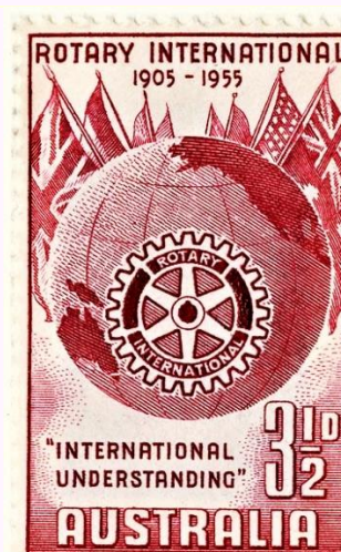
A stamp issued by Australia in 1955 in honor of Rotary's 50th anniversary.