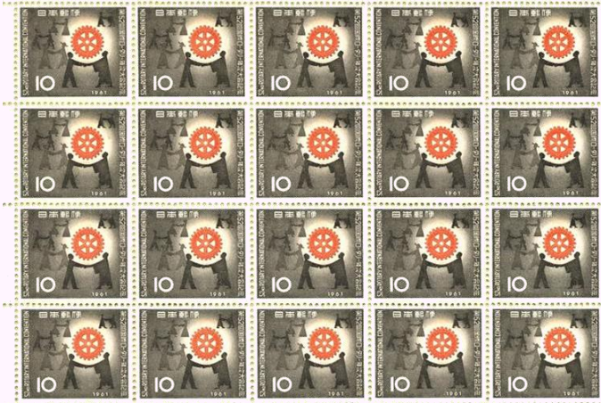
A stamp issued by Japan in honor of the 1961 Rotary Convention in Tokyo.

Stamps have also marked the anniversary of Rotary in individual countries and depicted projects and humanitarian activities. A 1960 Bolivian stamp bears the Rotary emblem and commemorates a children's hospital sponsored by the Rotary Club of La Paz. A 1976 stamp honors 40 years of Rotary in Fiji by highlighting a club project that raised money to buy an ambulance.