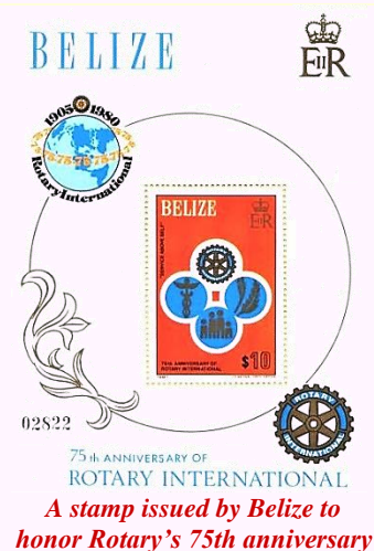
A stamp issued by Belize to honor Rotary's 75th anniversary

Countries around the world have honored the work of Rotary with commemorative stamps since 1931, when Austria created an overprint - a later printing over an officially issued stamp - in honor of the Rotary International Convention in Vienna.