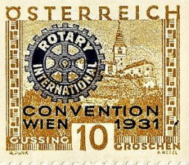
One of five stamps issued by Austria in 1931 in honor of the Rotary Convention held in Vienna that year

several postcards and stamps, as well as a postage cancellation stamp in the shape of the Rotary emblem. The Maldives issued a series of stamps based on Rotary's Health, Hunger, and Humanity Grants.