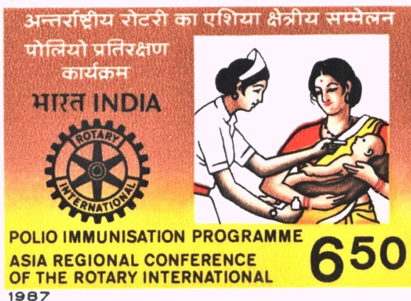
A stamp issued by India in 1987 to commemorate the Asian Regional RI Conference in New Delhi and to promote polio immunization.

Many Rotarians collect commemorative Rotary stamps. Since 1955, a group now known as the International Fellowship of Rotary on Stamps has collected and researched Rotary-related philatelic material.