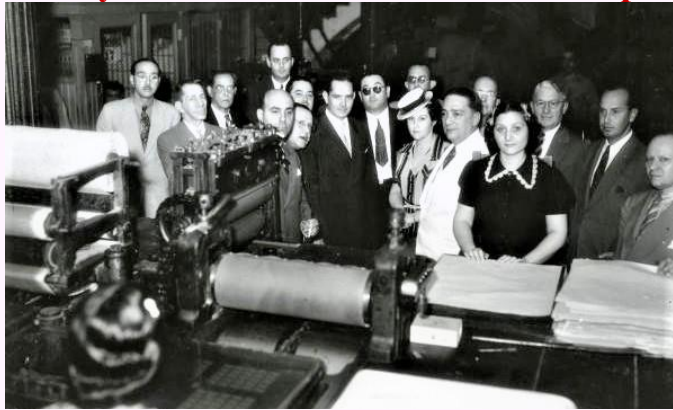
Members and guests of the Rotary Club of Havana, Cuba, at the printing of the commemorative stamp issued by Cuba for the 1940 Rotary convention in Havana.

Countries around the world have honored the work of Rotary with commemorative stamps since 1931, when Austria created an overprint - a later printing over an officially issued stamp - in honor of the Rotary International Convention in Vienna.