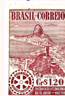
A stamp issued by Brazil on the occasion of the 1948 Rotary Convention in Rio de Janeiro.

In 2005, Rotary's centennial inspired stamps from nations including France, Ghana, Peru, and Togo.