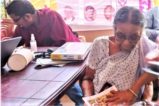
As done in each camp, nutrition and personal hygiene booklets were handed over to each beneficiary of the Matri Raksha Anemia Screening and Treatment Camp.