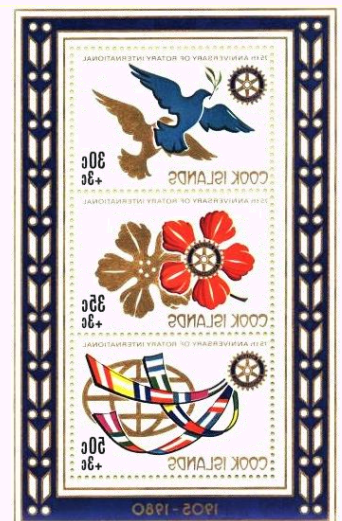
Stamp issued by the Cook Islands in 1980 for Rotary's 75th anniversary.

Rotary's 75th anniversary was honored with commemorative stamps from Benin, Cyprus, Djibouti, Dominica, Ghana, and others. The postal service of the Netherlands Antilles issued